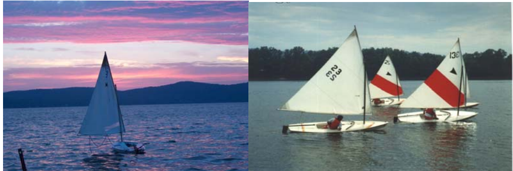
Sailing at Kingsland Point Park, Sleepy Hollow, NY